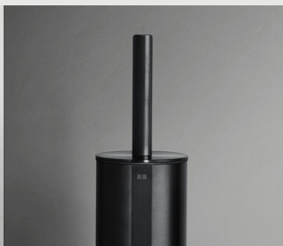
TOILET BRUSH FLOOR 422 (H) x 89 (Ø) mm