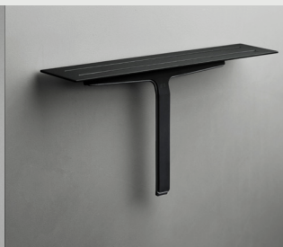
SOAP SHELF AND SHOWER WIPER soap shelf 350 (L) x 85 (W) mm wiper 243 (L) x 187 (W) mm