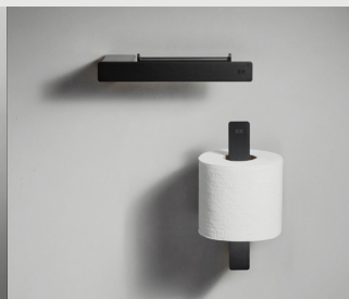
TOILET PAPER HOLDER 191 (L) x 34 (H) mm