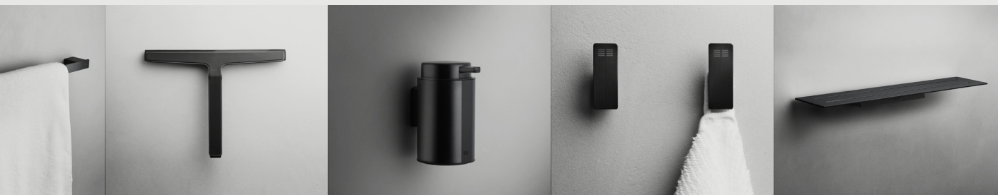
SHOWER WIPER 243 (W) x 187 (H) mm