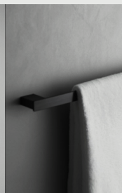
TOWEL BAR 605 (L) x 25 (W) mm