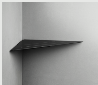
CORNER SOAP SHELF 288 (L) x 211 x 211 mm